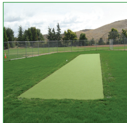
New Windemere Ranch Cricket Pitch

The newly designed cricket pitch renovation has been completed at Windemere Ranch Middle School. Professionally designed by one of the City's contract landscape architects, with input from the San Ramon Cricket Association (SRCA), the new facility will offer much improved playing surfaces from the pitch itself to the surrounding grass field.