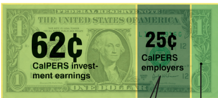
For the City of San Ramon, CalPERS payments come from the General Fund

The California Public Employees' Retirement System (CalPERS) is the largest pension system in the country. It was established in 1932 as a defined benefit pension system. That means that employees who vest in the system – typically after five years of service – have a right to collect a monthly payment at retirement for the rest of their lives. CalPERS gets its funding from three sources: Employer contributions, Employee contributions and investment returns.